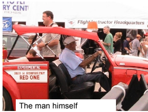
The man himself