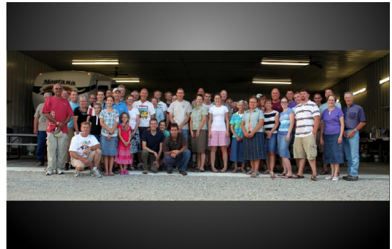
Some of my friends