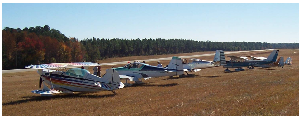
Some of the planes on the flightline.