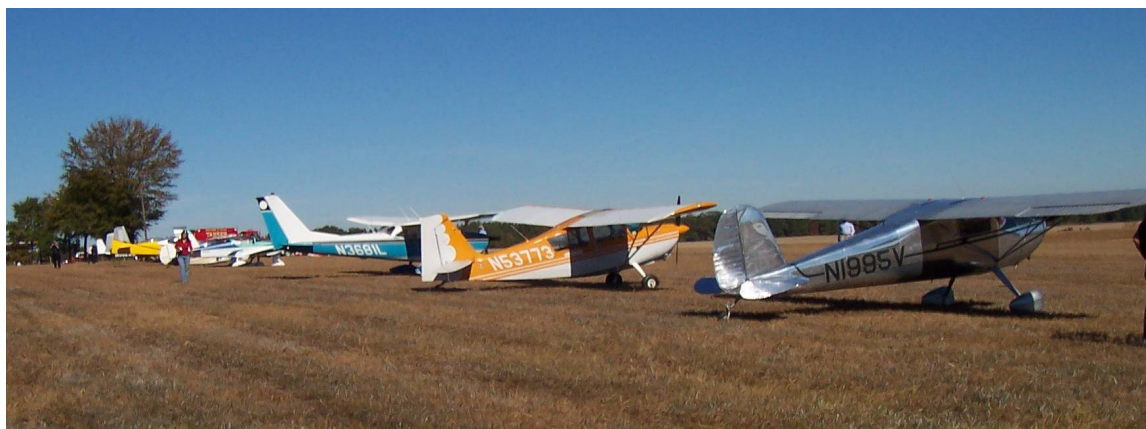
More of the flightline.